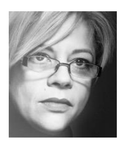
Other directorships: Phoenix Edge Ltd,